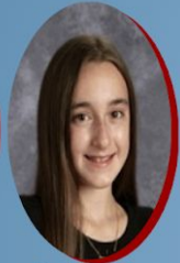
Orchestra Ella Mesopotanese