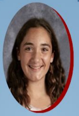
ART Gabby Sia