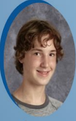
Chorus Har-El Shrem