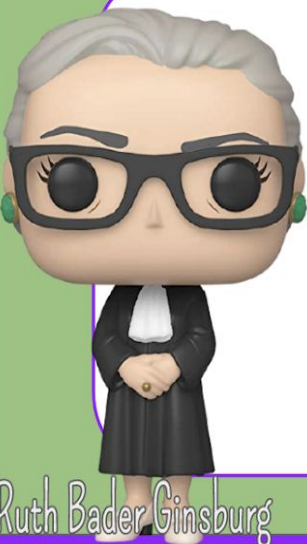
Ruth Bader Ginsburg

"Don't be distracted by emotions like anger, envy, and resentment. These just zap energy and waste time."