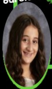
Band Naya Ashji