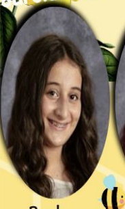
Band Naya Ashji