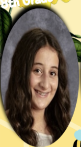
Band Naya Ashji